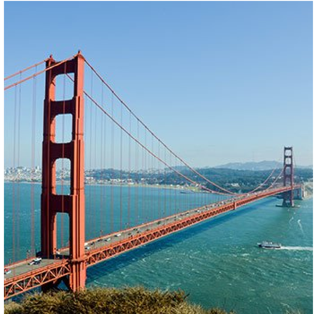
California: A new pork market

As part of its ongoing work to achieve maximum market access for farmers, during 2023 Red Tractor has been focused on securing this export opportunity for UK pig farmers and processors.