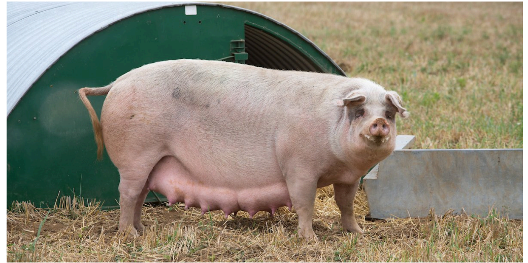
Now Prop 12 compliant: Red Tractor bred pigs

"This is an important milestone for the pigs sector in this country. Hopefully it can be the start of a productive and ongoing new trading relationship. We're encouraging the CDFA to visit the UK so that they can see first-hand the high standards our Red Tractor farmers work to."