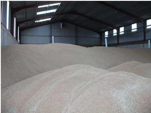
An example of the interior of a long-term store. Note the solid capping between the concrete panels and the cladding.

Cladding must be of a suitable construction as not to allow ingress of water, rodents, and birds.