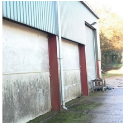
The sides of the shed are clear of vegetation.

While small gaps in construction at low levels must be avoided there is a degree of more tolerance at height. For instance, the small gaps caused by the profile of the cladding in the images below could be acceptable because, the gaps are too small to allow bird access, and they overhang the main structure of the shed. In addition, the sides of the shed are clear of vegetation and stored items therefore not allowing vermin to easily climb to the gaps.