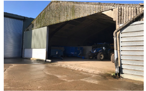
A good example of a loading area that services a dryer, a temporary and long-term grain store.

Loading areas outside ALL grain stores must be maintained in a clean and well-drained condition.